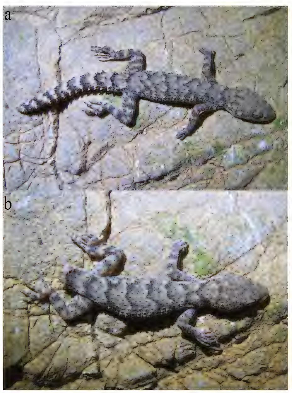
Fig. 4. Dorsal view in life of (a) holotype and (b) paratype of Lakigecko aaronbaueri sp.n. before preservation.

tubercles on dorsum and tail); from Hemidactylus by non-dilated digits (vs. well-defined dilated digital bases); from Pseudoceramodactylus Haas, 1957, Crossobamon Boettger, 1888, and Stenodactylus Fitzinger, 1826 and Teratoscincus by digits without elongate fringes (vs. digits with well-defined lateral elongate fringes); from Parsigecko Safaei-Mahroo, Ghaffari, and Anderson, 2016 by large, keeled tubercles on body dorsum, subcaudal scales small and strongly keeled (vs. without dorsal tubercles, and subcaudal scales large and smooth).